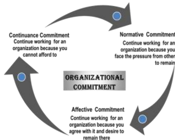
Figure 1 Types of Organizational Commitment

Source: Greenberg and Baron, Behavior in Organizations (New Jersey: Pearson Prentice Hall, 2008) p. 236.